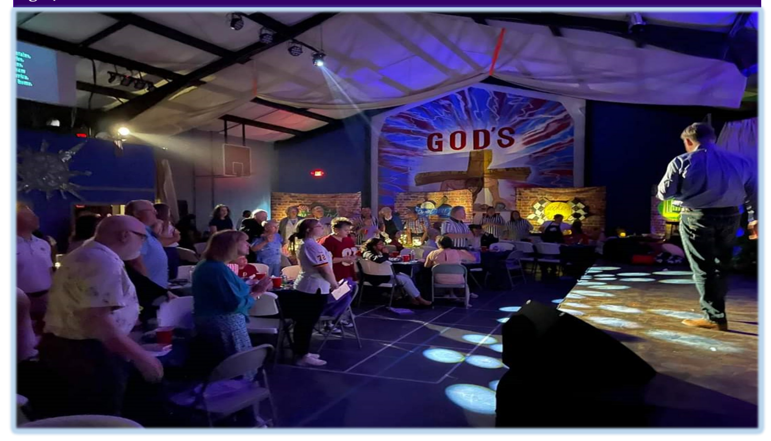
On Tuesday, April 26th, we had our yearly Volunteer Banquet.