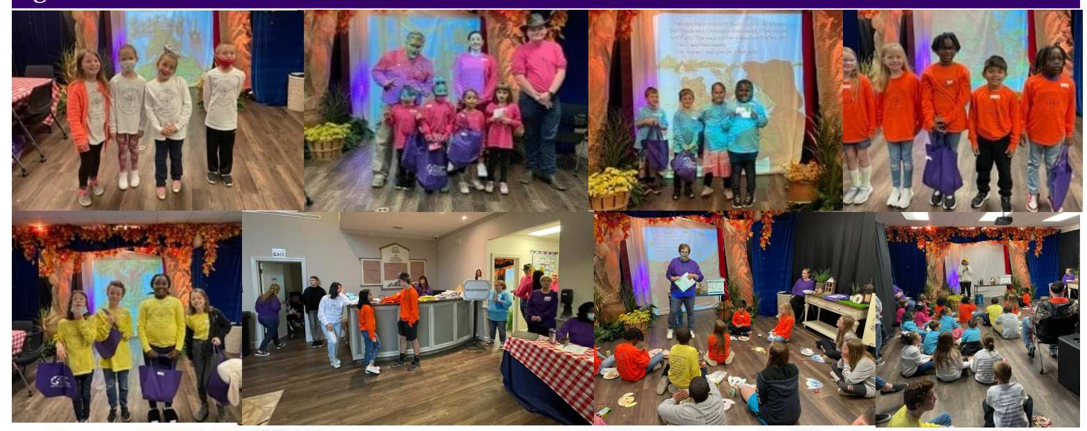
Pg. 10: YOUR HOMETOWN - SPRING 2022