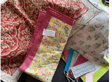
Beautiful Quilts made by Quilting for the Community First United Methodist Church, Rockingham, NC